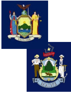
New York & Maine Raffle