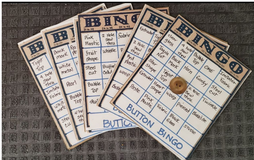
Button Bingo with Sandi Plummer

Come play Button Bingo... an easy game for everyone in which types of buttons and materials are substituted for numbers. Whether you are just learning about different buttons or are well-versed, you can play for fun and prizes.